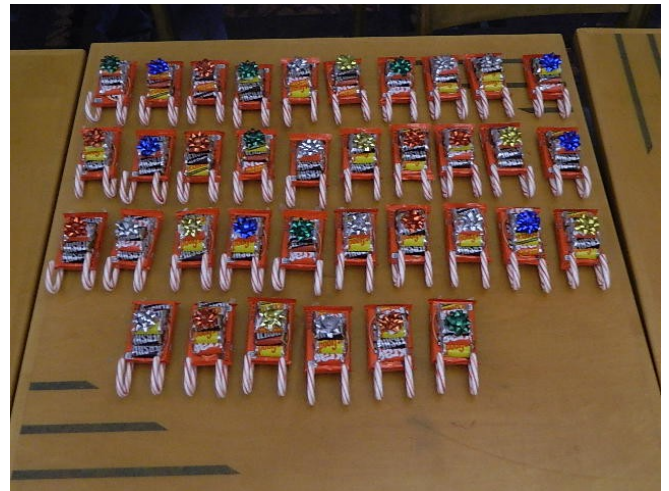
Candy sleds made by the Legion, Auxiliary, Auxiliary Jr's, and SAL members for the Christmas program at the Grand Canyon.