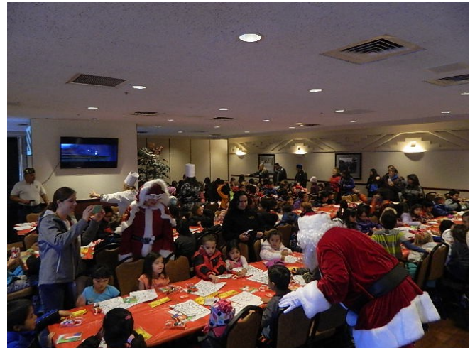
Santa and Mrs. Claus greeting the school children at the Christmas program at the Grand Canyon.